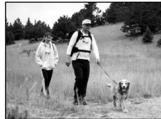
PHOTO: A family and their dog enjoy a past year's Farish Volksmarch