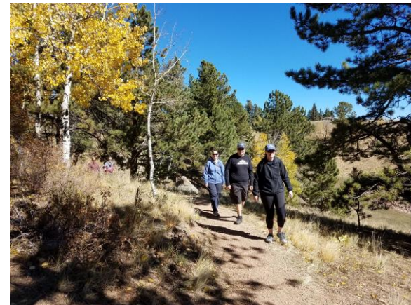
PHOTO: Walkers on a past Farish Volksmarch