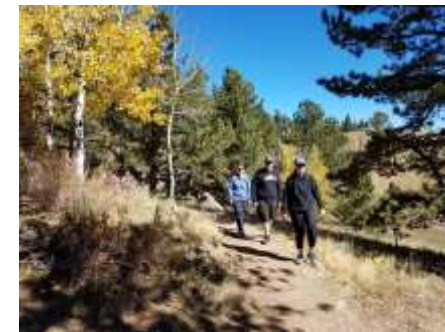
PHOTO: Walkers on a past Farish Volksmarch