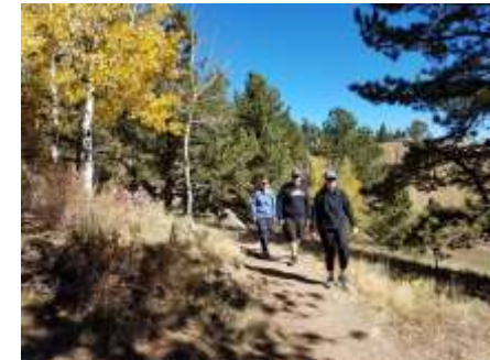
PHOTO: Walkers on a past Farish Volksmarch